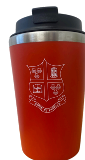
Travel Mug £9.99