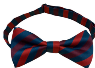
Bow Tie £11.99